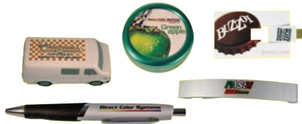
Ad Specialty Items