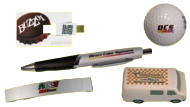
Ad Specialty Items